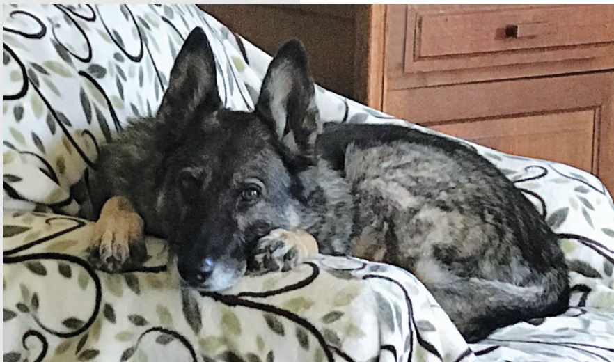
"Jessy," an accomplished performance German Shepherd Dog, developed osteosarcoma at age 10. The devastating bone cancer occurs most commonly in large and giant breeds.

Osteosarcoma, or bone cancer, is a tough, challenging malignancy. No one knows exactly what causes osteosarcoma; however, large and giant breeds are considered to be at higher risk due to their size and weight. A review article published in June 2019 in Veterinary Sciences cited research indicating that osteosarcoma most commonly develops at or near the site of the growth plates, where cell turnover is highest. The extremely high risk of osteosarcoma developing in the limbs of large- and giant-breed dogs may be the result of replicative mutations during the normal processes of cell division required to create longer bones, with only modest contributions from heritable or environmental factors, according to sources referenced in the article.